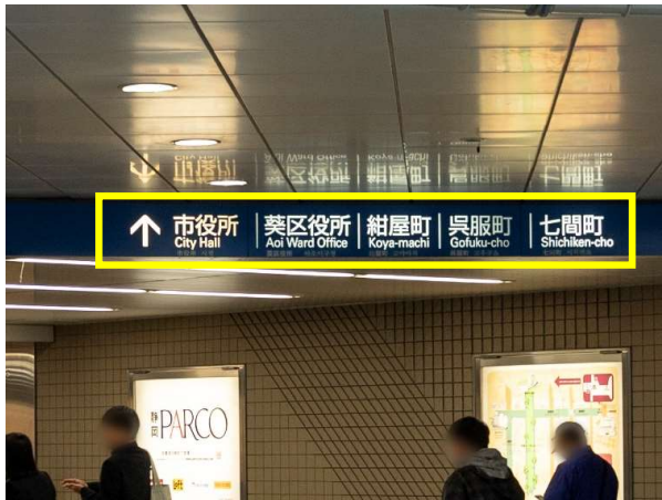
Proceed towards "City Hall" on the left.