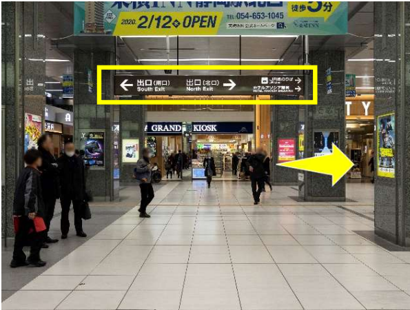
When you exit the Shinkansen / train ticket gate, you will see the exit (north exit/south exit) sign in front of you. Please head towards the north exit.

【Reception】 Post Code 420-0852 1-5 Kyoyu Bldg. B1F Koyamachi, Aoi Ward, Shizuoka City