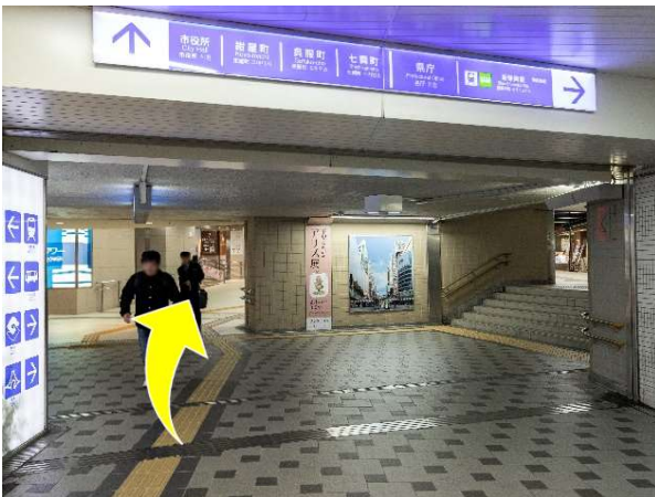
There are stairs on your right, but go left.