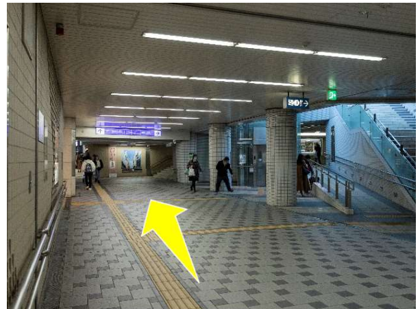
There is a place with stairs, a ramp, and an elevator on your right. Please continue straight ahead.