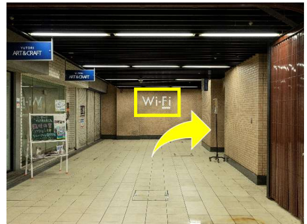
If you go straight, you will come to a wall where you can see a "Wi-Fi" sign. Turn right and you will arrive at your destination.